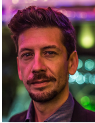
Leon Radojkovic Composition

Leon Radojkovic is an award-winning composer and multi-instrumentalist. He is the creator and composer behind Live Live Cinema and its previous three productions, Carnival of Souls , Dementia 13 and The Little Shop of Horrors .